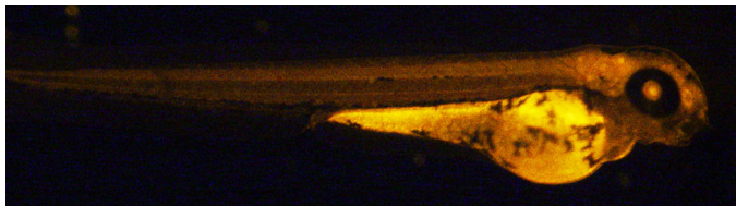
Hatching process of a normal zebrafish embryo.

that microRNAs are involved in making new blood vessels used to spread breast cancer cells to other organs of the body and could be used as blood biomarkers for early detection of breast cancer. Interestingly, the findings in this paper show that PGE2 mediates important cellular events involved in vertebrate development and maturation of new blood vessels. Hence, use of anti-inflammatory drugs (PGE2 blockers) could easily stop normal cell functions mediated by PGE2. This identifies PGE2 as a key regulator in vertebrate development and functions. Thus, our research places a cautionary note on the use of NSAIDs. It also establishes zebrafish as a good in vivo model for anti-cancer drug researches.