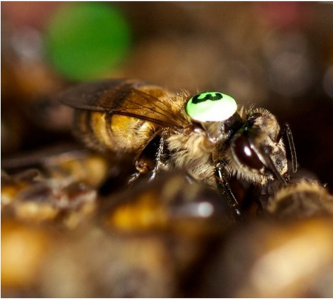
Tagged honeybee worker.

organization and evolution of social insects and my research hopes to advance our understanding of sociality in insects. As of what's next, I'm currently developing a project that focuses on studying the role of microbiota in regulation of biological clocks during honeybee behavioral development.